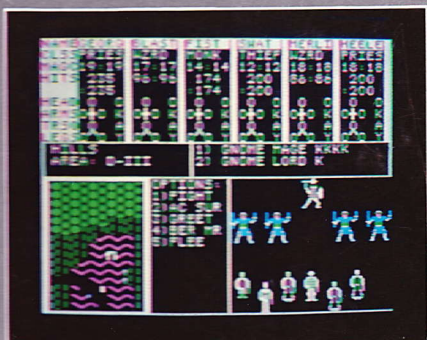
Screen shows character statistics and map of the Wilderness. Your party is engaged in mortal combat with Mage and Lord Gnomes.

Judged as either a sequel to one of the most successful fantasy series or as a complete game in its own right, The Wrath of Nikademus promises a spell-binding storyline with enough twists and turns to satisfy your wildest fantasies!